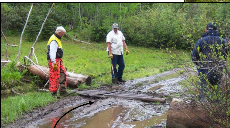
Fixing a water bar to drain excess water.